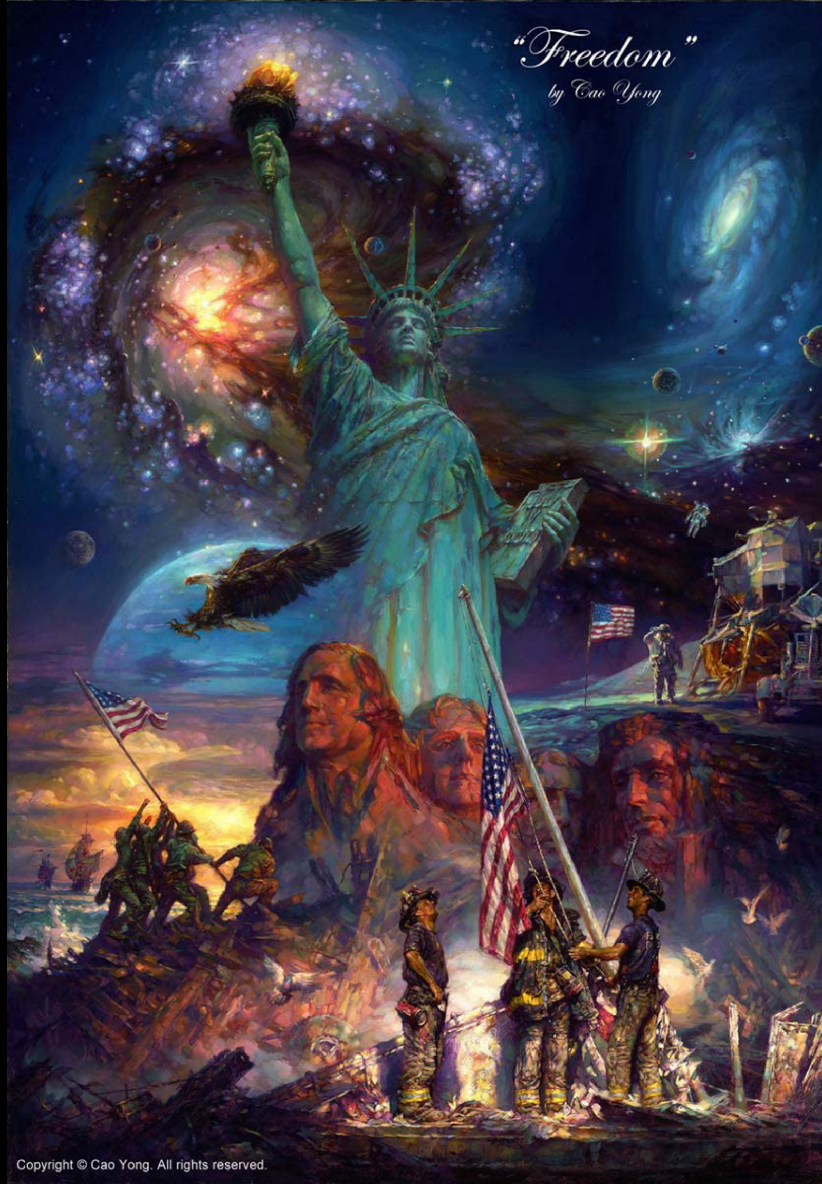
Freedom, 2002 Cao Yong Oil on Canvas